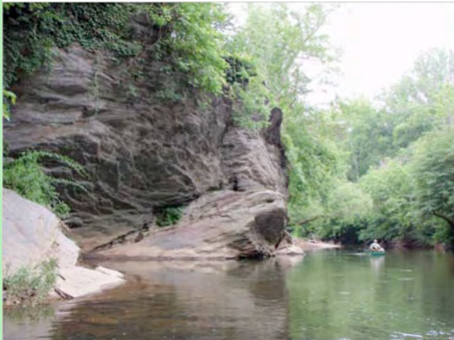
Between Rt 626 and Rt 733