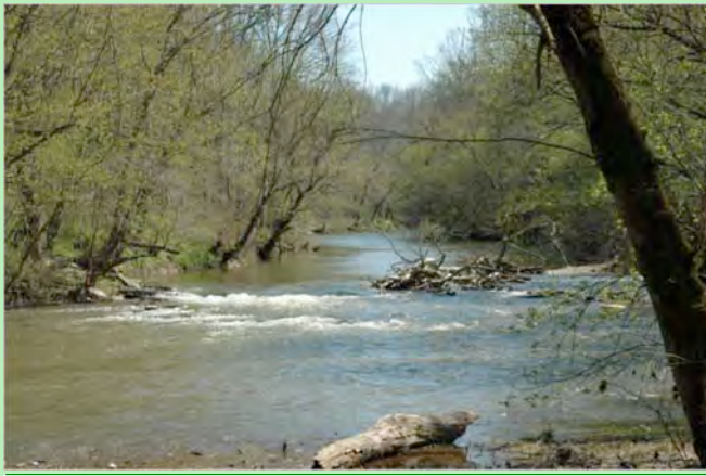
Lime Kiln Rd, west of Crooked Bridge