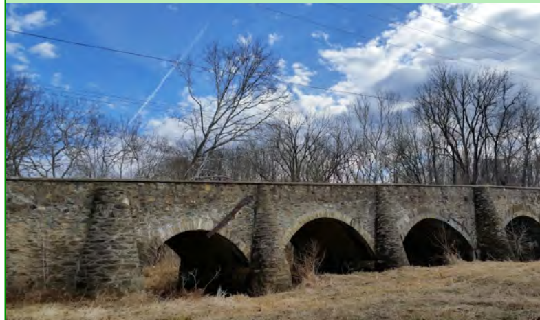
Goose Creek Stone Bridge

State-appointed committee supported by the Loudoun County government.